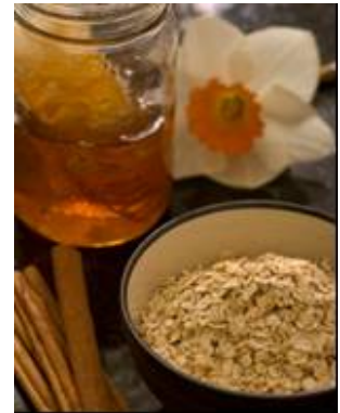
Honey and Oatmeal for facial scrubs. See "How to" article on page 5 . . . Yummy Body Scrubs.