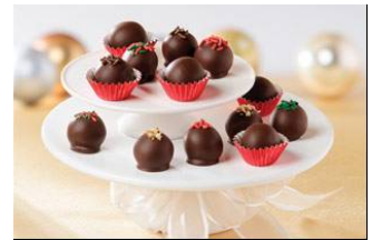
Simply Sensational Truffles